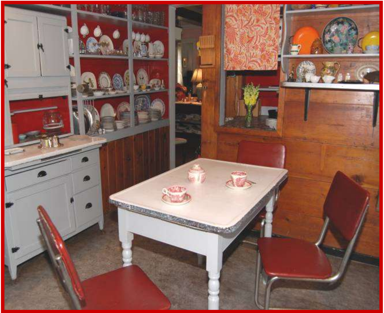
The kitchen table from Clinton Street where Ebby and Bill sat in November 1934 for that momentous meeting which changed all our lives... (Currently at Stepping Stones)